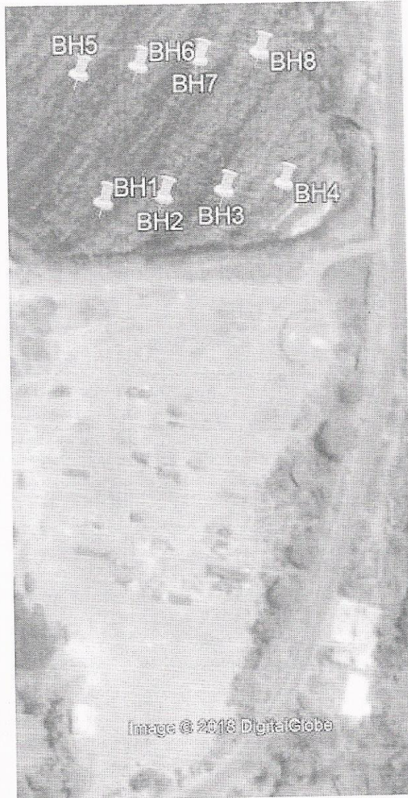
Google earth image with borehole location