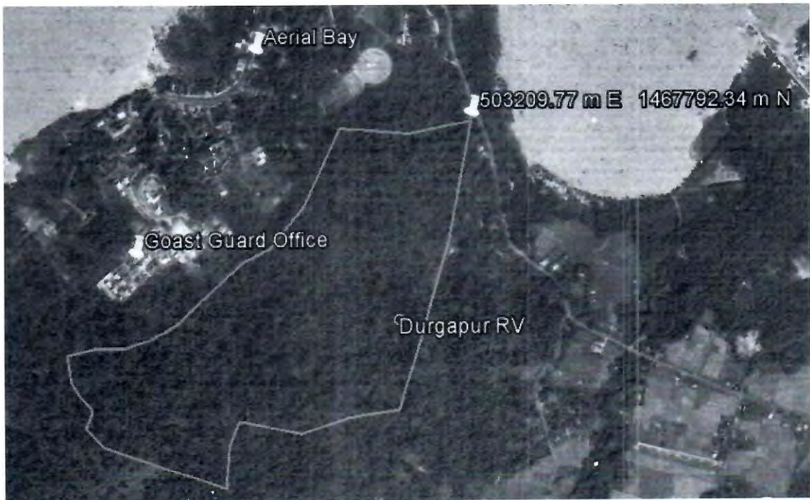
Fig:1- Location of OTR Diglipur.

Diglipur is the largest town of North Andaman Island, in the Andaman Archipelago, India. The city is located on the southern side of Aerial Bay, at 43 metres (141 feet) above sea level, 290 kilometres (180 miles) north of Port Blair. It is crossed by the Kalpong River, the only river of the Andaman islands. Saddle Peak, the highest point in the archipelago,[1]lies about 10 km to the south.