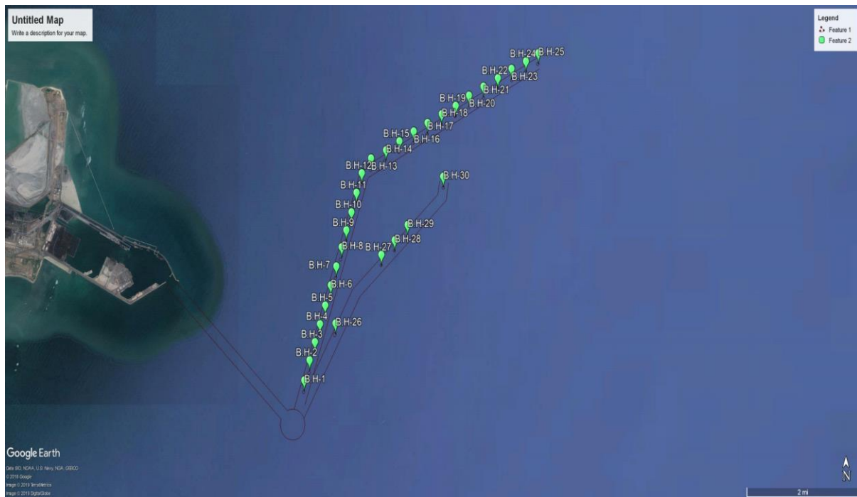
Fig 1. Location map of V.O. Chidambaranar Port Trust, Tuticorin

The project scope is to conduct Geotechnical investigations on the alignment of the proposed Approach/outer channel of V.O.Chidambaranar Port, Tuticorin. The indicative locations of the boreholes are shown in Fig.